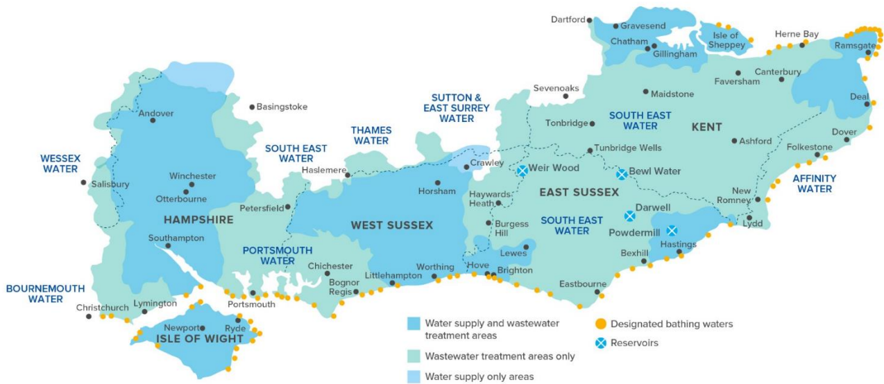
Figure 4: Southern Water operational areas

Southern Water recognises its environmental performance has fallen short of expectations. The company has set out a Turnaround Plan to address this. You can read it here: 6579_ofwat_company_turnaround_plan.pdf (southernwater.co.uk) .