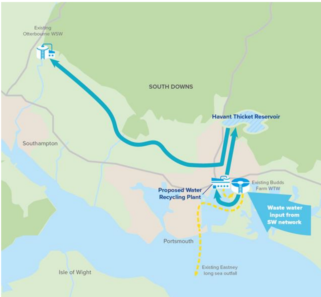
Figure 2: A schematic showing the main components of the proposed HWTWRP.

A similar combined solution, previously known as Option B.5, utilising a new lake for water storage rather than the Havant Thicket Reservoir, and involving a larger water recycling plant, emerged as the second most preferable solution. This option provided a ‘back-up’ option in case our preferred solution could not be delivered. However, this option is not currently being progressed through the consent process.