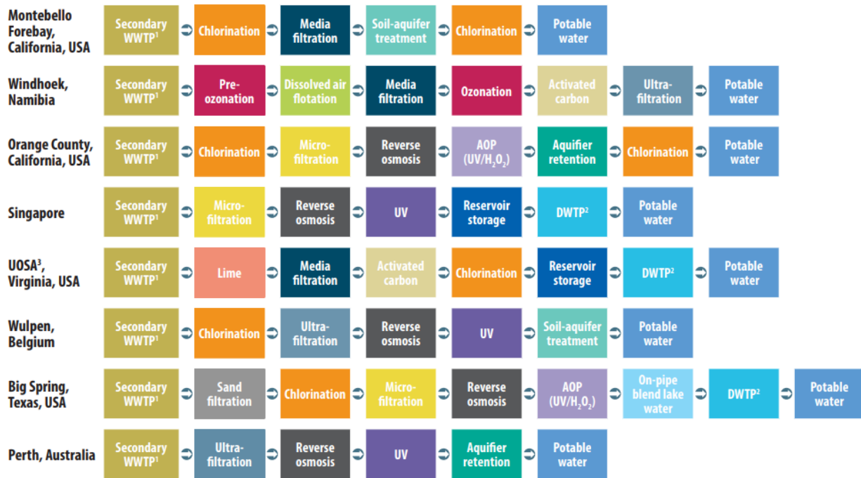
Figure 3: Examples of water reuse scheme from around the world