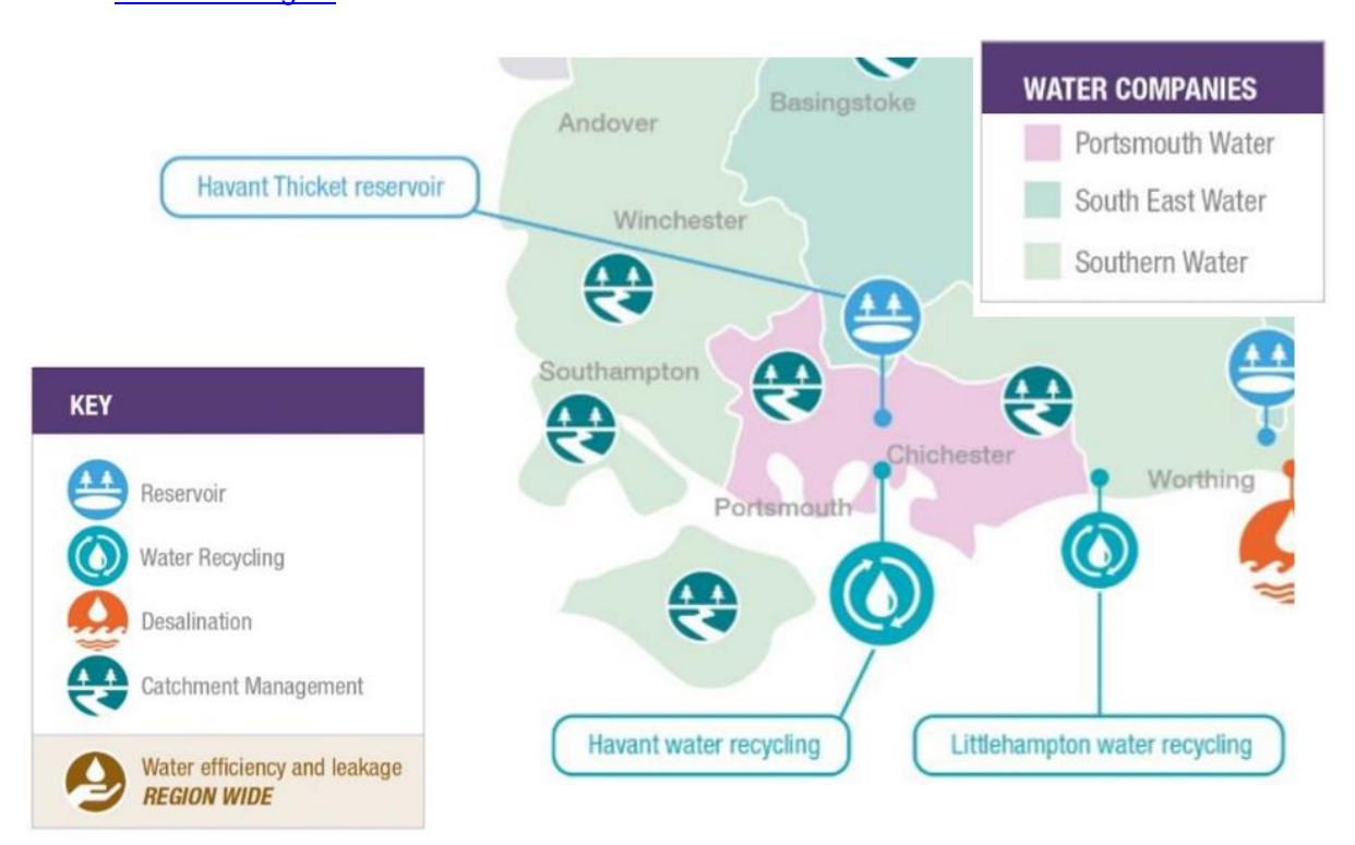
Figure 1: What the draft emerging regional plan is signalling for Portsmouth Water

To support this pre-consultation process and prevent duplication across each of the six water companies across the South East, WRSE are consulting at a regional scale on a draft emerging regional resilience plan based on least cost. We would encourage all our stakeholders to have a look and make comment on this regional consultation as well as our local one. More information about this consultation can be found at <a href="https://www.wrse.org.uk">www.wrse.org.uk</a>.